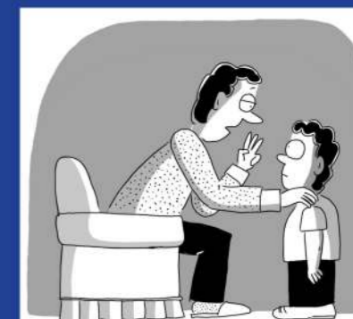
"SON, THERE ARE THREE THINGS I WANT YOU TO NEVER FORGET... NEVER GIVE UP ON A DREAM... MARRY FOR LOVE... AND USE 8-DIGIT COMPLEX PASSWORDS!"